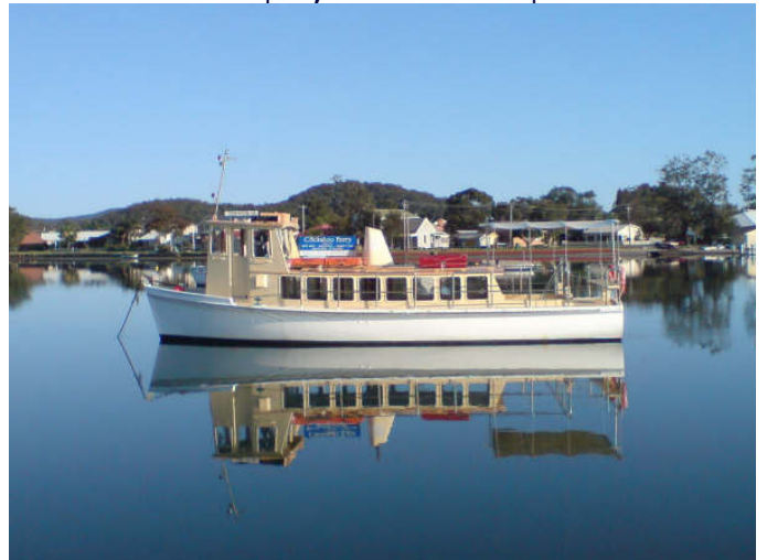
CODOCK II mirror image....