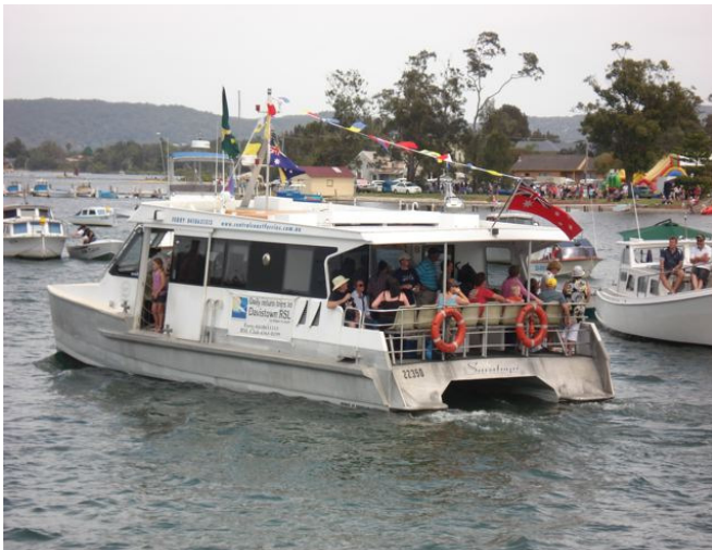
The SARATOGA in the middle of it all..