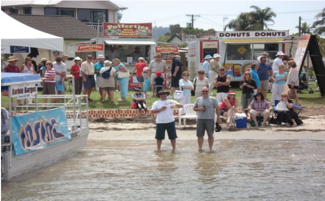
Dodgy Characters on the Waterfront...

SUNDAY 26 th OCTOBER :THE PUTT PUTT REGATTA!!! AWESOME DAY!!!