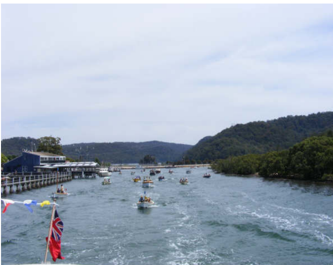
Putters in Woy Woy Channel.....